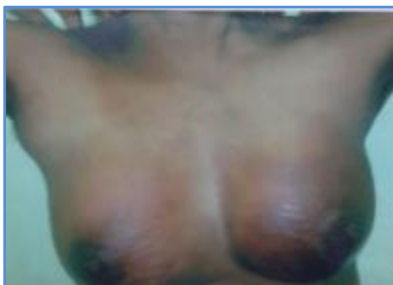
Fig. 1: Photograph of the patient with bilateral breast lymphoma