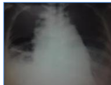
Fig. 2: X-ray of the patient showing Rt. Pleural effusion with enlarged mediastinal shadow