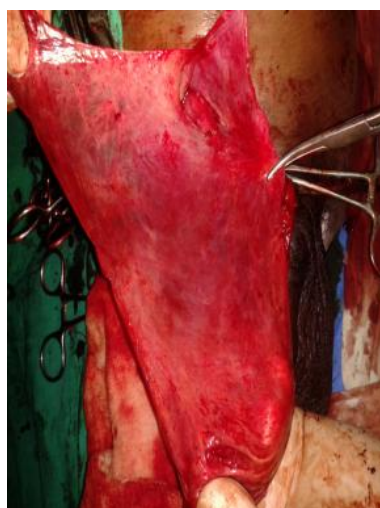
Fig-3: long hernial sac