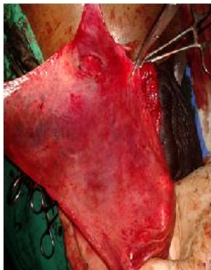
Fig-1: hernial sac