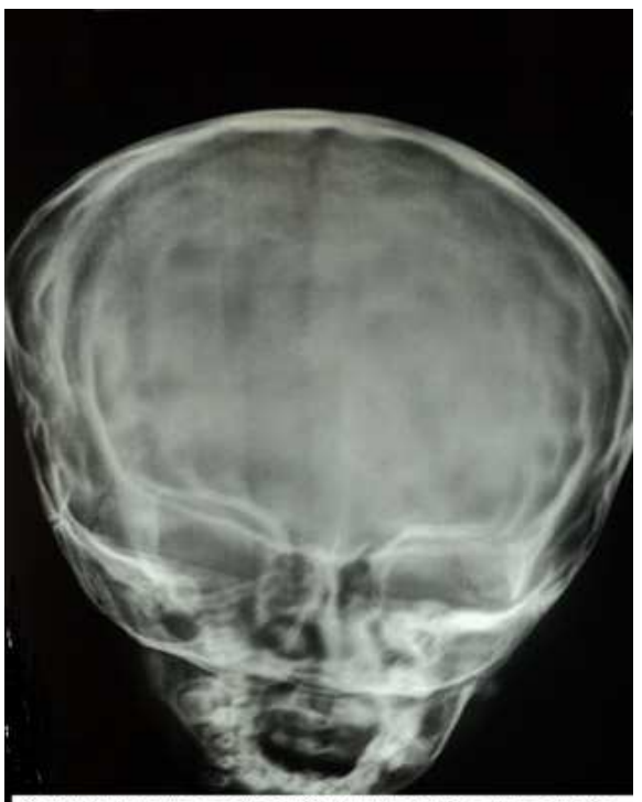
Fig (v) X ray anteroposterior view skull showing hypoplastic maxilla and zvoomatic arch