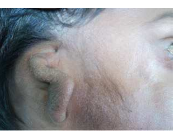
Fig ii showing preauticular sinus, meatal atresia and microtia