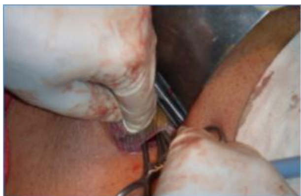
Fig. 11. Mesh is Unfurled