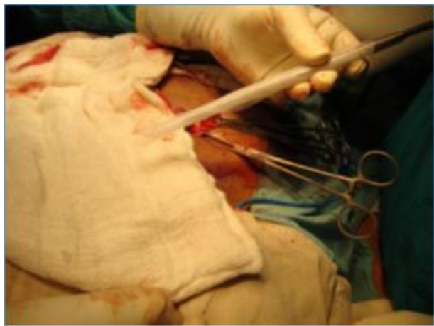
Fig. 9. Mesh is Rolled Up