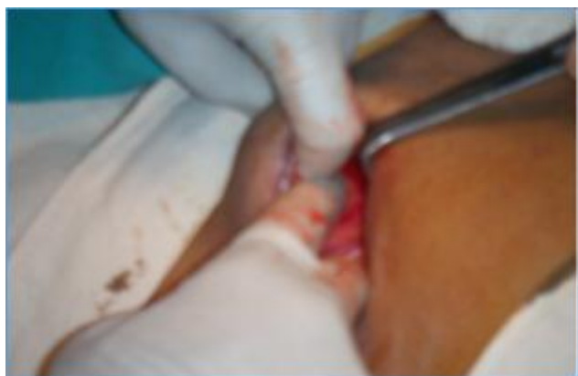
Fig. 3. Preperitoneal Space is Reached