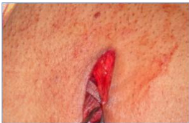
Fig. 12. Mesh is Spread Evenly