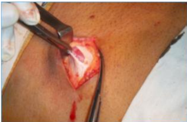
Fig. 2. External Oblique is Split