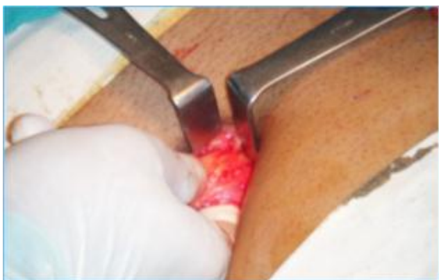
Fig. 4. Sac along with the Cord Structures are Lifted