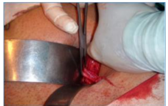
Fig. 7. Parietalisation of the Cord