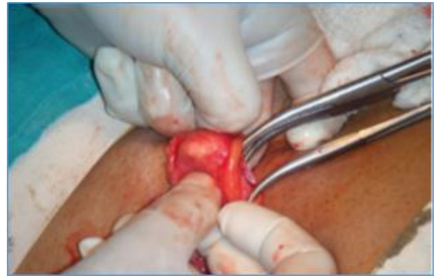
Fig. 5. Sac and Cord are Separated