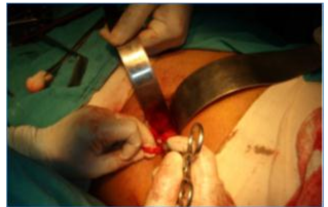
Fig. 6. Placement of Retractors