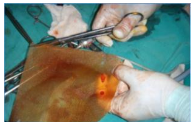
Fig. 8. Mesh is Trimmed