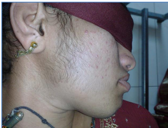
Fig. 1: Hirsutism

CASE: A 20 year old nulliparous unmarried woman came to Government general hospital with complaints of progressive oligomenorrhoea of one and half years duration. She had been amenorrhic for the past one and half year. She had noticed excessive growth of hair on face, chest and limbs and hoarseness of voice for one year, recession of breast (and increased sweating and fatigue for one year).Headache for 10years which is occipital in nature with nausea and reeling sensation and relieved on taking some analgesic. There is no history of anorexia, weight loss/gain. Her medical and family history is uneventful.