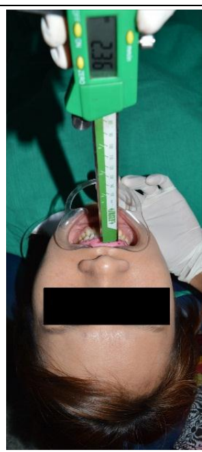
Figure 4. Placement of the Modified Digital Vernier Calliper for Measuring the Gingival Thickness in the Maxillary Mid Papillary Region for Every Patient