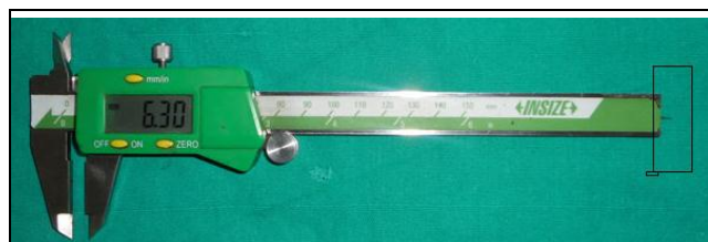
Figure 2. Modified Digital Vernier Calliper used for Assessing Gingival Thickness