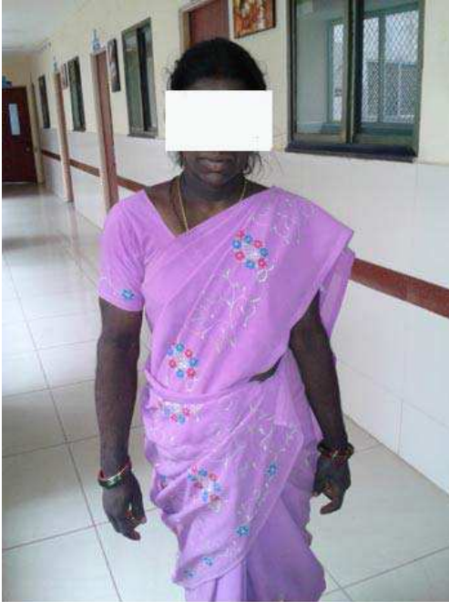
Figure 1: A young woman with significant hirsutism, coarse facial features and darkened skin.