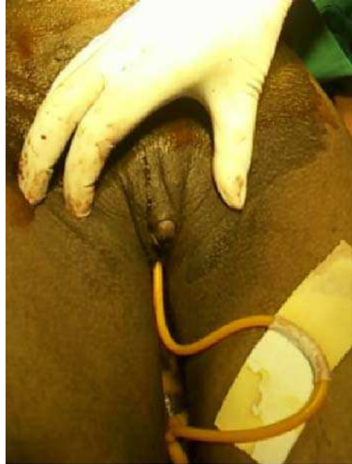
Figure 2: Clitoral hypertrophy with acanthosis nigricans of the groin