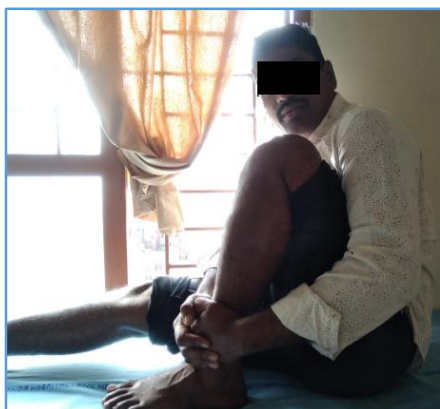
Figure 1. 1 Yr. Followup Fixation with Interference Screw Showing Good ROM