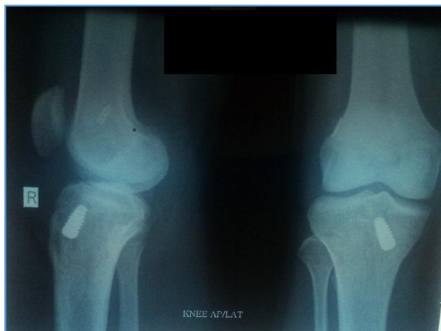
Figure 7. X Ray Showing Graft Fixation with on Loop Endobutton