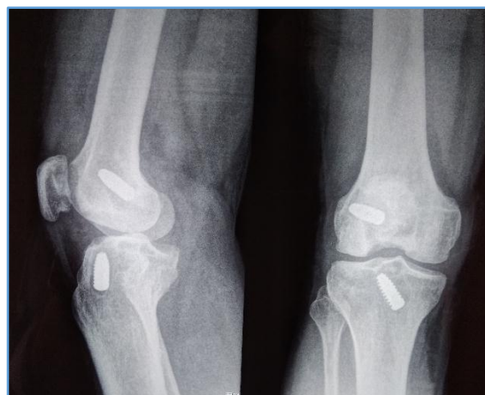
Figure 6. X Ray Showing Graft Fixation with Interference Screws