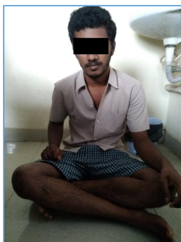
Figure 2. 1 Yr. Followup Case of on Loop Endobutton Fixation