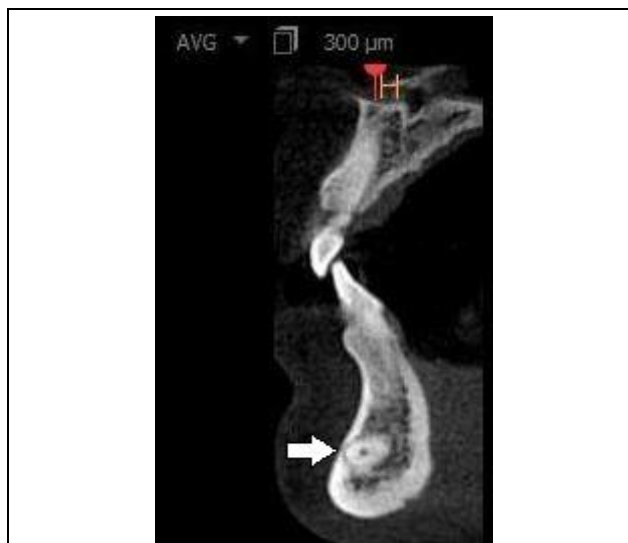
Figure 3. Sagittal Section Showing the Impingement and Near Perforation of the Labial Cortical Plate by the Horizontally Impacted Transmigrated Canine 33