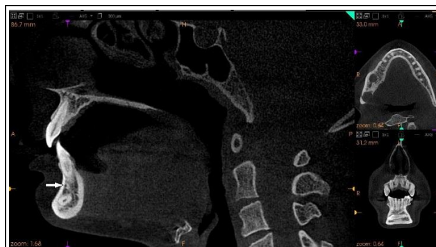
Figure 2. Sagittal Section Showing GT as Round Hypodense Structure of Width 1.5mm Located Coronal to the Horizontally Impacted 33 and Labial to the Apices of the Incisors with Corticated Borders