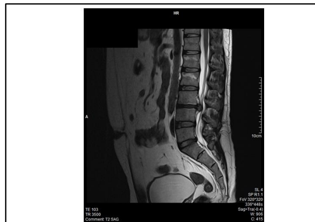
Figure-5. Sagittal T2WI shows loss of lordosis. Protrusion of disc material at L3-L4 level causing spinal canal stenosis [white arrow]. Desiccation is seen is also seen in L3-L4 disc. Disc bulge is noted at L5-S1 level.