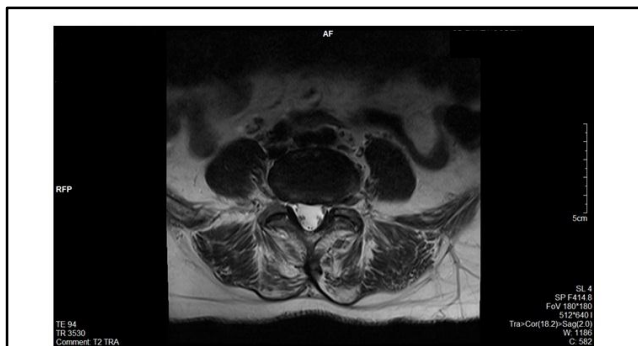
Figure-7. Axial T2WI shows bilateral facet arthropathy [arrow] and bilateral ligamentum flavum thickening [double arrow] at the level of L4-L5. At the same level diffuse posterocentral and bilateral paracentral disc bulge is also seen.