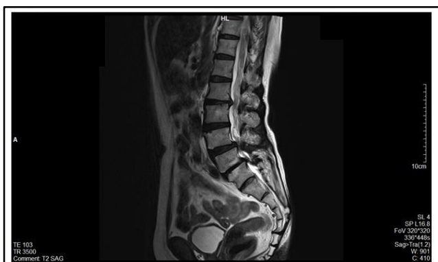
Figure-3. T2WI Sagittal image shows disc bulge at L2-L3, L4-5 & L5-S1 level associated with narrowing of IVDS at L2-3 & L5-S1 level (elbow connector). Disc desiccation is seen at multiple levels (arrows). Schmorl's nodes are seen in upper end plate of L3, 4 & S1 (double arrows). Minimal anterior subluxation of L5 over S1 (spondylolisthesis- grade 1) is noted [white arrow].