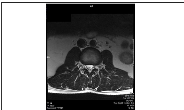
Figure-1. Axial T2WI shows normal disc. High signal intensity in nucleus pulposus [double headed arrow] and low signal intensity in annulus fibrosus [arrow].

[D- Diffuse posterocentral; D BIL- Diffuse posterocentral and bilateral paracentral; R- Right paracentral; D + R- Diffuse posterocentral and right paracentral. L- Left paracentral; D + L- Diffuse posterocentral and left paracentral; PARA BIL- Bilateral paracentral; Prot- Protrusion; Extr- Extrusion; Seq- Sequestration; LR- Lateral recess; NF- Neural foramen; BIL- Bilateral]