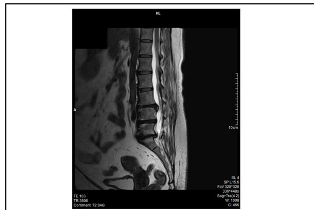
Figure- 4. Sagittal T2WI shows loss of lumbar lordosis with retrolisthesis of L5 over S1 vertebra [double arrow]. Annular tear with evidence of diffuse posterocentral disc bulging is seen at L3-L4 level [arrow]. Diffuse posterocentral disc bulge is also seen at L4-L5 & L5-S1 level.