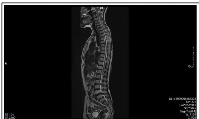
Figure-2. Sagittal T2WI of whole spine shows normal lumbar lordosis.