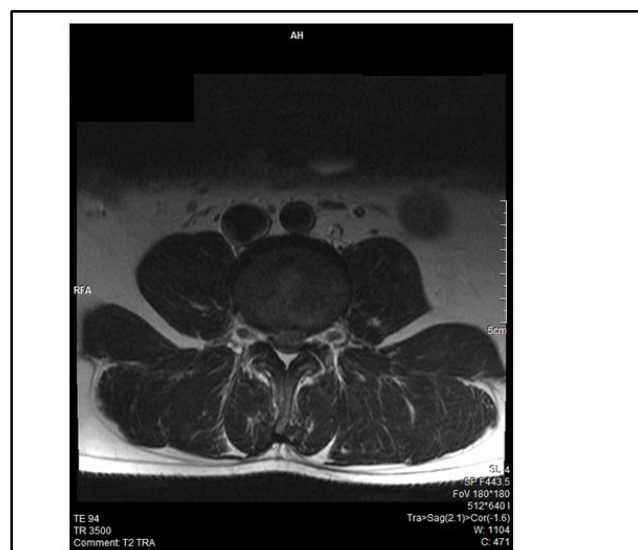
Figure-6. Axial T2WI showing protruded disc causing spinal canal stenosis