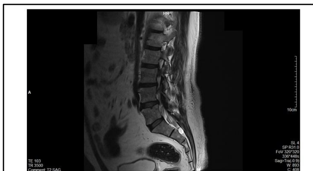
Figure-8. Sagittal T2WI shows tarlov cyst at the level of S2 vertebral body [white arrow]. Schmorl's node is noted at upper end plate of L5 (double arrow). Disc desiccation is seen at L1-2, L2-3 & L3-4 level (arrows).