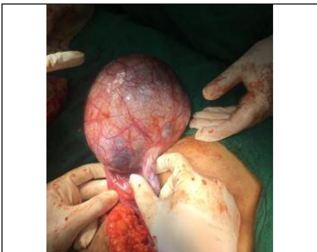
Figure 1. Intra Operative Picture of the Right Ovarian Cyst

An exploratory laparotomy was performed to confirm the diagnosis and to remove the cyst. Intraoperatively a cystic mass was visible of 11 x 11 x 5 cm arising from the right ovary separate from the uterus (figure 1). The right ovarian cyst was then dissected and sent for frozen section to determine the course of our surgery. Report of the frozen section of the right ovarian cyst was negative for malignancy and hence conservative approach was taken in the surgery. Right ovarian cystectomy was done and healthy ovary was left behind.