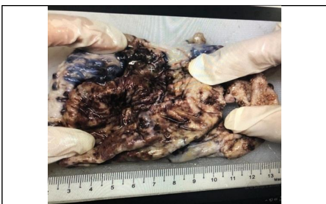
Figure 2. Gross Appearance- Cut Section of the Cyst