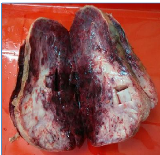
Figure 2. Polypectomy Specimen of Pedunculated Cervical Fibroid Polyp