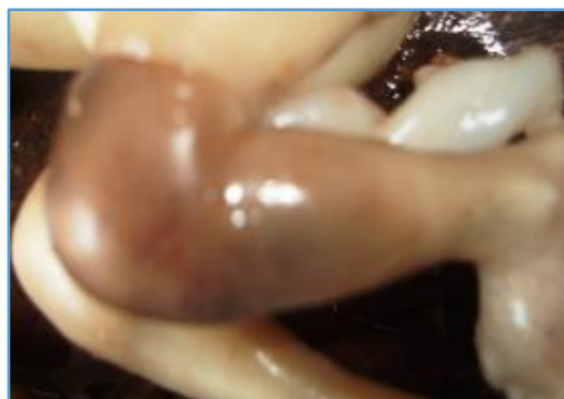
Figure 7. 22 Weeks Foetus with Amniotic Band on Left Thigh

One case of amniotic band of left thigh was noted (Figure 7).