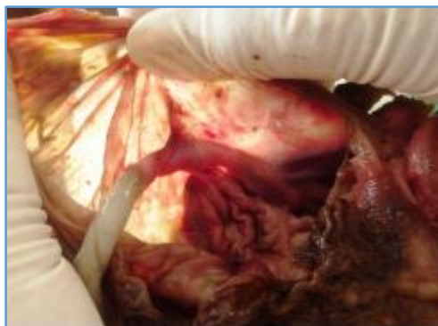
Figure 6. Velamentous Insertion