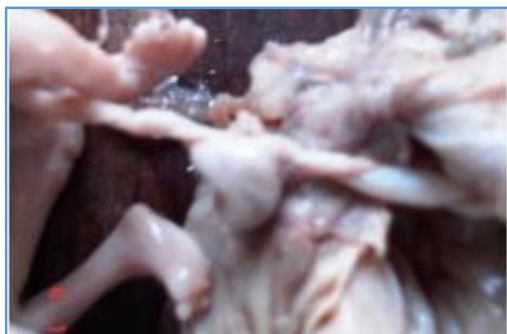
Figure 1. 20 Weeks Foetus with True Knot

One true knot and one false knot have noted and shown in Figures 1 and 2. Cross section of the pseudoknot is shown in Figure 3.