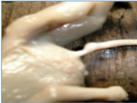
Figure 8. 18 Weeks Foetus with UC Constriction Near Foetal End

One case of UC constriction was noted near the foetal end of the UC (Figure 8).