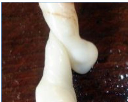
Figure 2. 22 Weeks Foetus with Pseudoknot