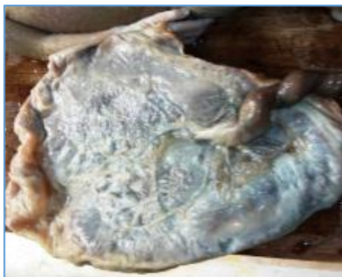
Figure 5. Marginal Insertion