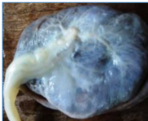
Figure 4. Central Insertion

95.45% cases (N= 105) were presented with central insertion (Figure 4), 3.64% cases (N= 4) were presented with marginal insertion of the cord (Figure 5) and 0.91% cases (N= 1) were presented with velamentous insertion of the cord (Figure 6).