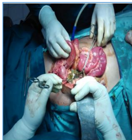
Figure 2. Bile in Lesser Sac

Financial or Other, Competing Interest: None.