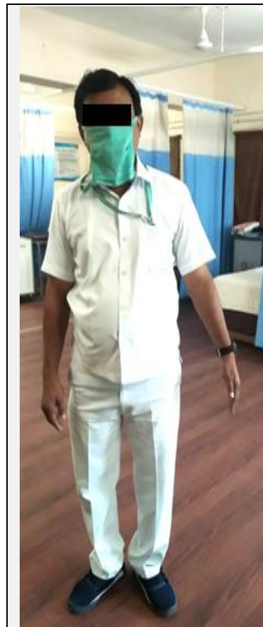
Figure 2. Pre-Treatment Photograph of Patient

Assessment of pain and functions of shoulder joint was measured by (SPADS) shoulder pain and disability scale. On shoulder pain and disability scale (SPADS) pain score was 86 % and disability score was 75 % before the treatment.