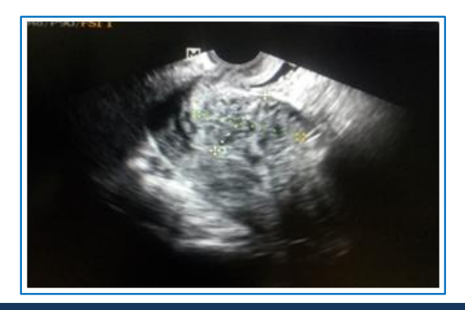
Fig. 2: USG showing residual scar site ectopic mass

Repeat USG showed highly vascular echogenic mass at the lower uterine segment with low \beta HCG value. So the case was reviewed and a rediagnosis of scar site ectopic was made. She was followed up with \beta HCG and USG. 3 months after starting therapy \beta HCG came to normal, but the mass was persisting but vascularity reduced by 5 months' time (Fig. 2).