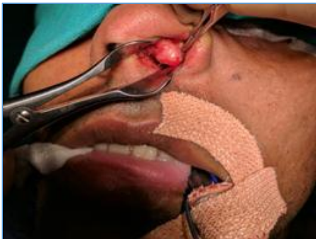
Figure 3. Intranasal Excision of the Mass

5) and a repeated nasal endoscopy revealed no recurrence of the disease.