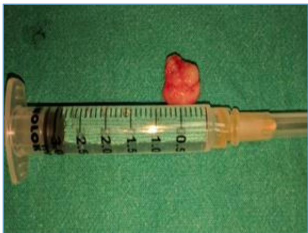
Figure 4. Specimen Removed from the Nose