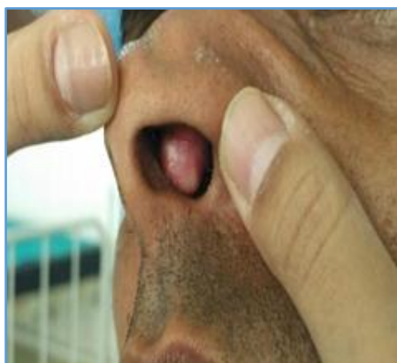
Figure 1. Mass seen in the Left Nostril

A 43-year-old male patient presented with a 1.5-year history of progressive left nasal septal mass (Fig.1) leading to left nasal obstruction for the last 1-1.5 years, two to three episodes of mild epistaxis and gradually enlarging mass involving the left nasal cavity. There was no history of previous trauma, surgeries or visual defect. His general health was satisfactory with a stable weight.