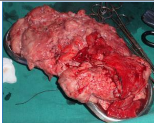
Figure 2. Specimen of Degenerated Fibroid after Surgery