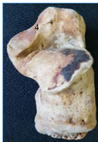
Figure 2. Anterior and Middle Facets Fused (constricted) [4- Fused and Constricted Anterior and Middle Facets]