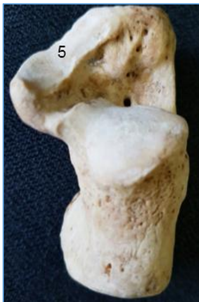
Figure 3. Anterior and Middle Facets Fused (Uniform) [5- Fused and Uniform Anterior and Middle Facets]