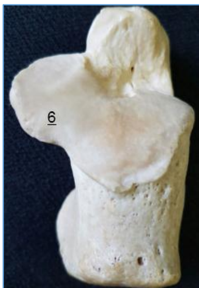
Figure 4. Middle and Posterior Facets Fused [6-Fused Middle and Posterior Facets]