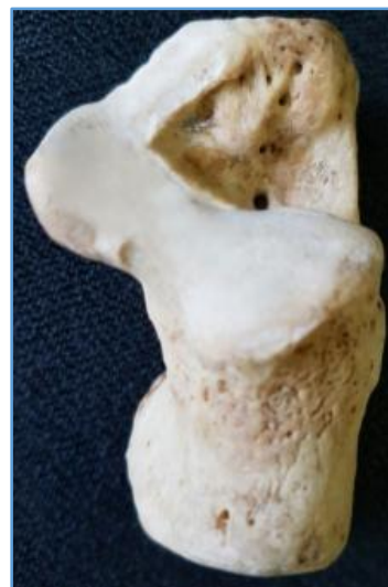
Figure 5. All Three Facets Fused to Form Single Facet