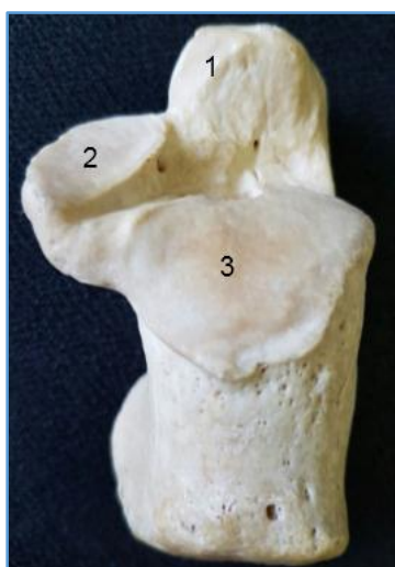
Figure 1. All Three Facets are Separated [1- Anterior Facet, 2- Middle Facet, 3- Posterior Facet]