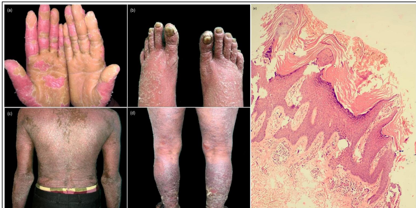
Figure 1. Clinical Features of Cases 1a) Palmar Keratoderma 1b) Subungual Hyperkeratosis 1c) Psoriatic Erythroderma 1d) Erythroderma Due to Stasis Eczema 1e) Histopathological Features of Biopsy (10 x)(H & E) Psoriasiform Dermatitis Showing Hyperkeratosis, Parakeratosis, Elongation of Rete Ridges