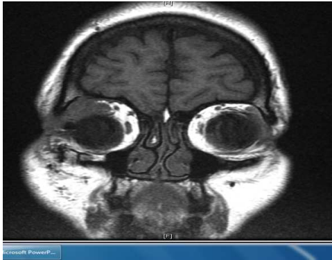
Fig -2 -MRI ORBIT