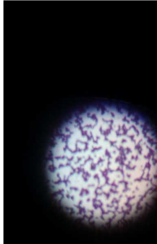
Fig -3 Gram stain - gram positive cocci in pairs and clusters staph aureus growth. Culture for fungus was negative