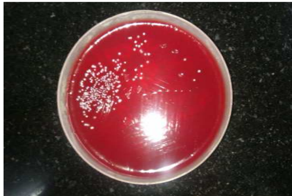
FIG-5 - Blood agar- cream lytic colonies