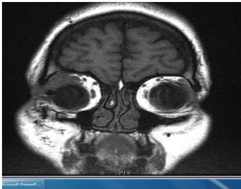
Fig -2 -MRI ORBIT