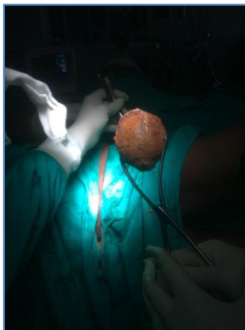
Fig. 3: Wood apple taken out