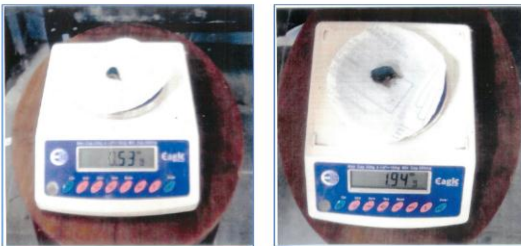
Fig No:2&3 Showing 28 Weeks of Fetus Weights of Right and Left Suprarenal Glands