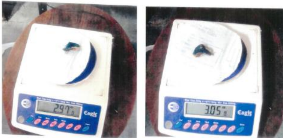
Fig No: 4&5 Showing Full Term Fetus Weights of Right and Left Suprarenal Glands