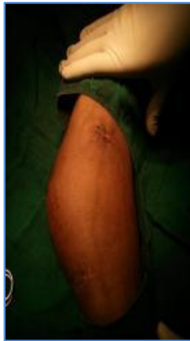
Fig 1: Vascular Tumor in the Forearm