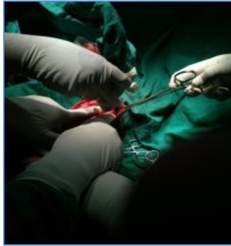
Fig 2: USG Probe Wrapped in Sterile Glove and Drape