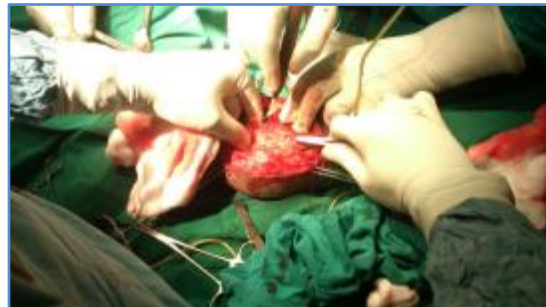
Fig 4: Ligation of Feeding Vessel