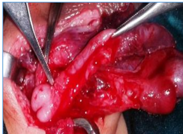
Fig. 1: Inflamed Appendix with Perforation in the Scrotal Sac

Surgical exploration of the inguino-scrotal region revealed a patent processus vaginalis containing purulent fluid with feculent smell. There was evidence of epididymo-orchitis and the spermatic cord was oedematous and thickened. The tip of the appendix was in the hernial sac, projecting about 3 cm through the internal inguinal ring. The tip of the appendix was perforated in the sac. Laparotomy through right lower paramedian incision revealed a long inflamed appendix Fig. 1 of all the cases. [3] extending into the patent processus vaginalis through the deep inguinal ring. Appendicectomy was performed in all the cases. [3,4] The right hemiscrotum and peritoneal cavity were irrigated and herniorrhaphy was performed by modified Bassini. No mesh applied. The postoperative recovery was uneventful. The patients were doing well in postoperative period. Follow-up for last 9 months reveals no abnormalities.