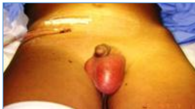
Fig. 2: Drain after Appendicectomy-Scrotum Inflamed