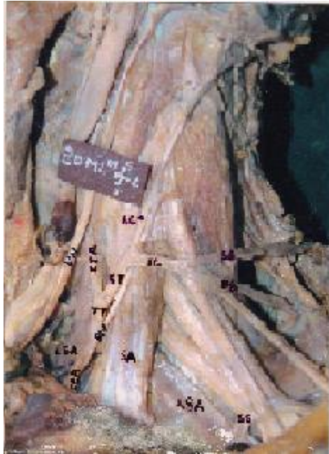
Fig 4. Showing normal course and relations of left subclavian artery (LSA). [PN: Phrenic nerve; SA-Scalenus anterior; TT- Thyrocervical trunk; ITA-Inferior thyroid artery]