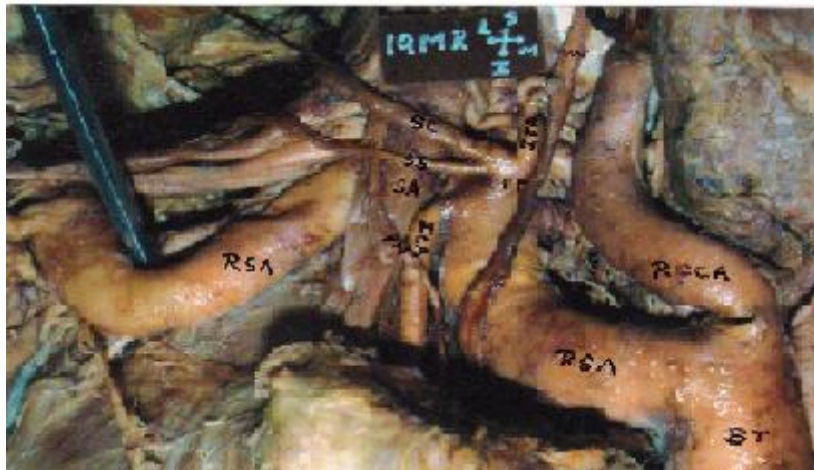
Fig 2. Abnormal S-shaped curve of High arched right subclavian artery (RSA).