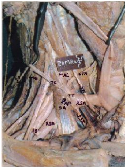
Fig 5. Showing normal course and relations of right subclavian artery (RSA). [PN: Phrenic nerve; VN-Vagus nerve; SA-Scalenus anterior; TT- Thyrocervical trunk; ITA-Inferior thyroid artery]