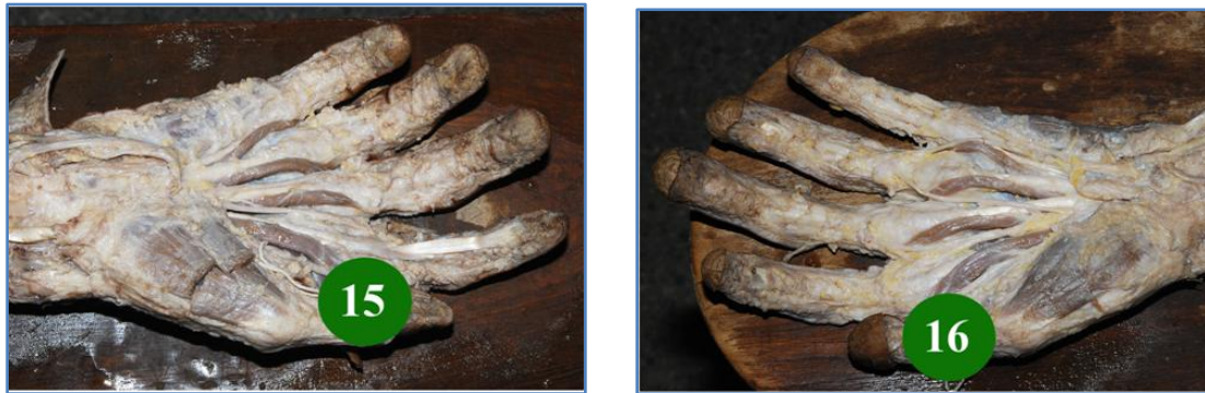
Fig. 9: Specimen No. 15&16