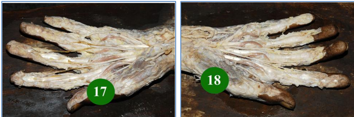
Fig. 10: Specimen No. 17 & 18

METHOD: Dissection of lumbricals and their nerve supply is carried out and the attachments and nerve supply noted. Photograph of each specimen was taken after the dissection with digital camera.