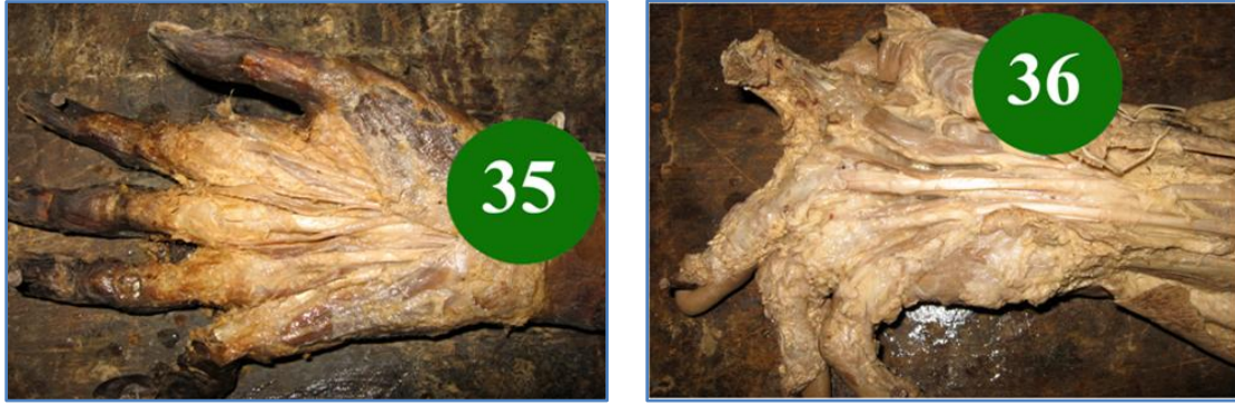
Fig.19: Specimen No. 35&amp;36