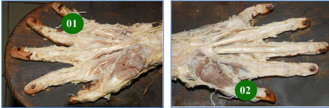
Fig. 2: Specimen No. 1 &2