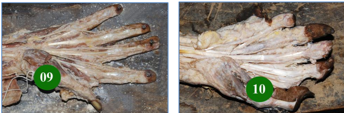
Fig.6: Specimen No. 9&10