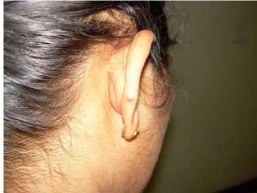
Fig.2 Aural lesions