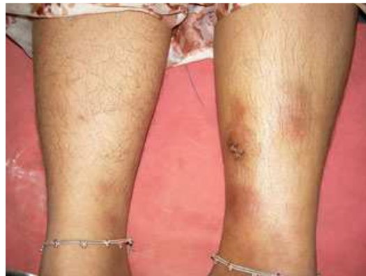
Fig.4 Nodules over shin