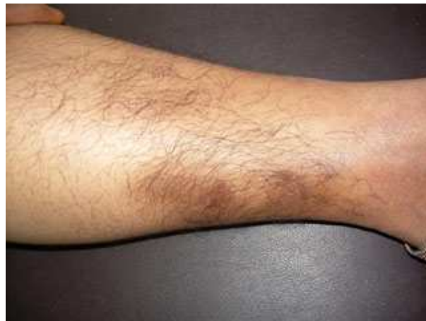
Fig.7 Tender nodules over legs captions for the study