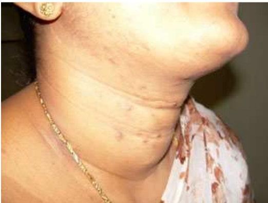
Fig.3 Neck lesions