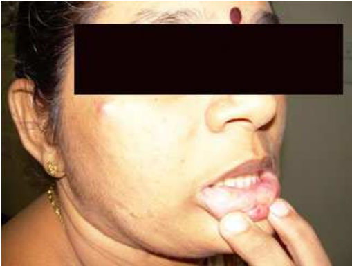
Fig.1 Mucosal lesions