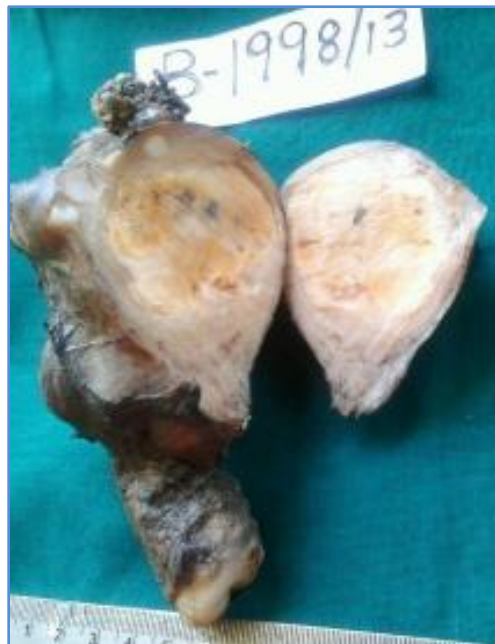
Fig. 1: Hysterectomy Specimen, cut section showing the largest fibroid with chalky white hard areas of calcification