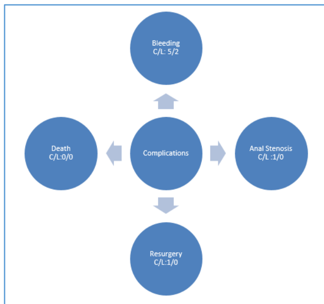
Figure 1. Comparative Complications of Conventional (C) and Ligasure (L) Methods