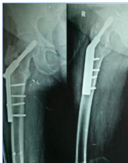
Fig. 2: Post-operative