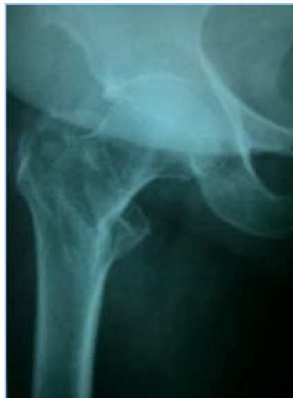
Fig. 1: Pre-operative

All the patients with stable fracture patterns had good-to-excellent functional outcome with PFN fixation, whereas 87.5% of unstable fractures had good-to-excellent functional outcome with PFN fixation.