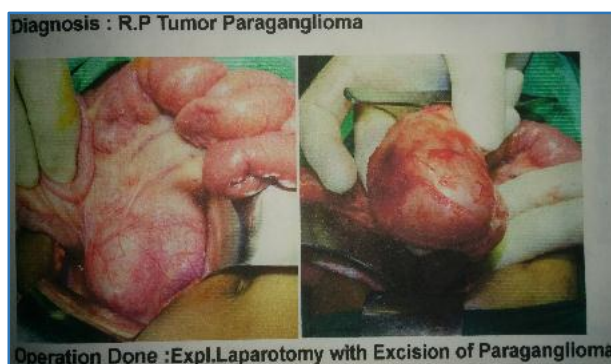
Fig. 1: post operative mass of ganglioneuroma