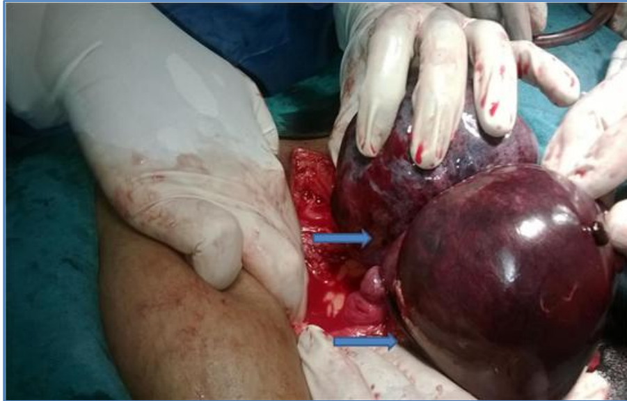
Right Ovarian cyst with 2 lobules attached to a common pedicle