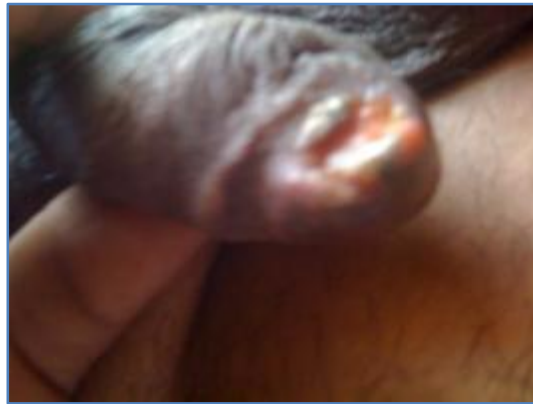
Fig. 1: Penile ulcer before ATT