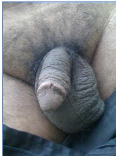
Fig. 3: healed penile ulcer after ATT