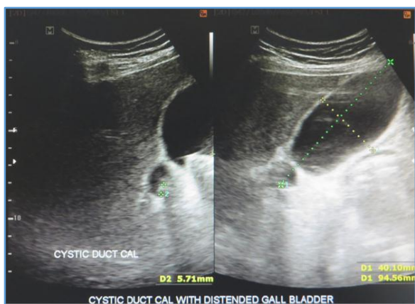
Figure 1. USG Picture of Distended GB with Cystic Duct Calculus

The mean GB length of patients with cystic calculi was found to be significantly higher than the mean GB length of patients not having cystic duct calculi ( p < 0.001 ).