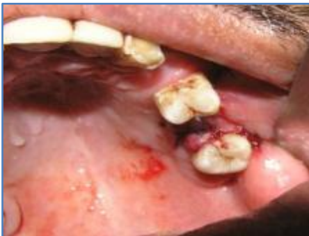
Fig. 3: Closure with buccal advancement flap