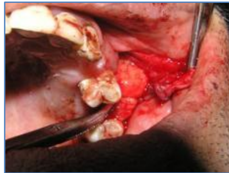
Fig. 2: Interpositioning BFP