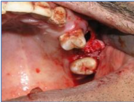
Fig. 1: Incision and flap reflection