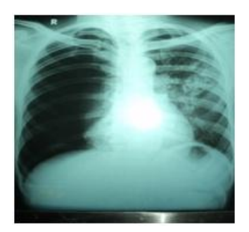
Fig.1 a. revealed right hypertranslucency, loss of lung markings, collapsed lung border with shift of mediastinum to left side s/o massive pneumothorax.