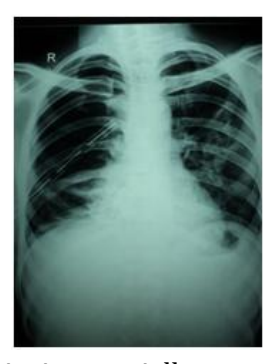
Fig 1 b. revealed ICD insitu, partially expanded lung with cavity.