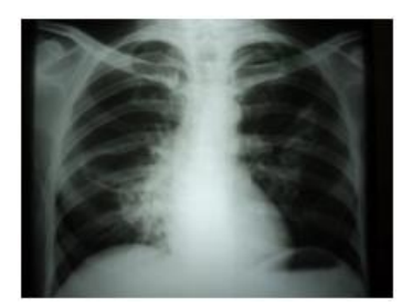
Fig.1 revealed left upper, mid zone infiltrations with right mid zone cavity

And there is thenar muscle wasting, loss of eye brows. etc. started on Tab. Dapsone 100mg once a day, Tab. Clofazimine 100mg thrice a day, Tab. Prednisolone 10 mg twice a day. After 5 days of treatment all the skin lesions subsided and patient improved symptomatically. And steroids tapered.