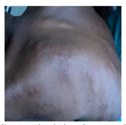
Fig.2 a, b, c revealed ICD insitu with multiple erythematous nodules all over the body