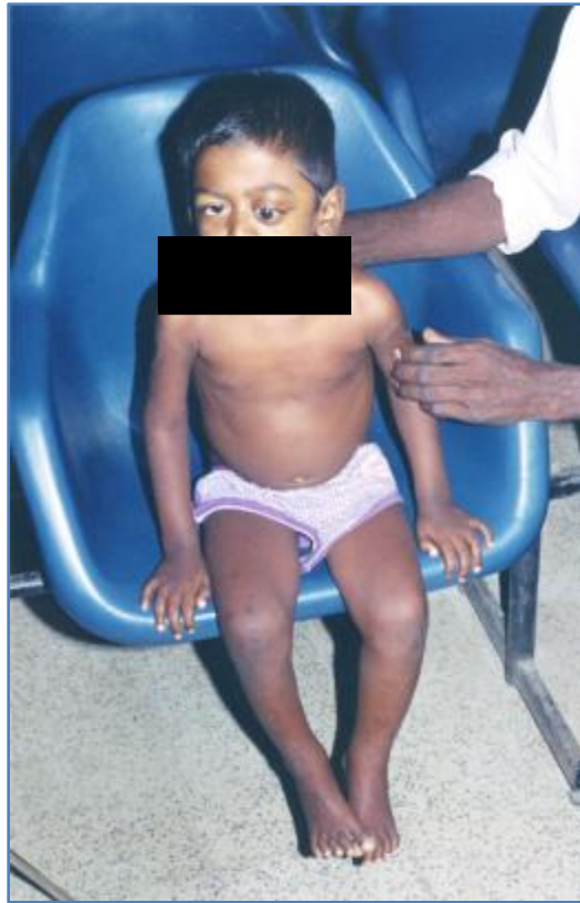
Fig. 5: Bilateral Proptosis due to Secondaries from Neuroblastoma

Incidence of proptosis due to primary intraocular malignancy like retinoblastoma is decreased, due to availability of modern equipments for early diagnosis and treatment.