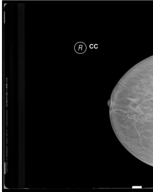
FIG. 1: CC view showing parallel vascular calcification (physiological)