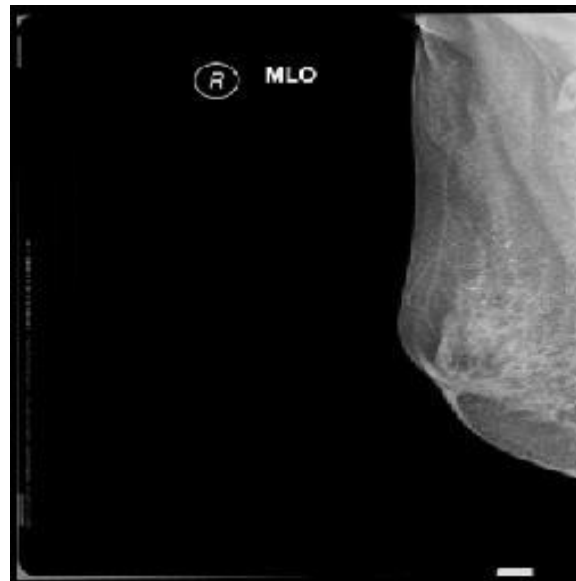
Fig. 4: MLO view showing scattered macro calcification suggestive of benign nature