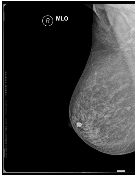
Fig. 2: MLO view showing popcorn calcification suggestive of involuting fibroadenoma