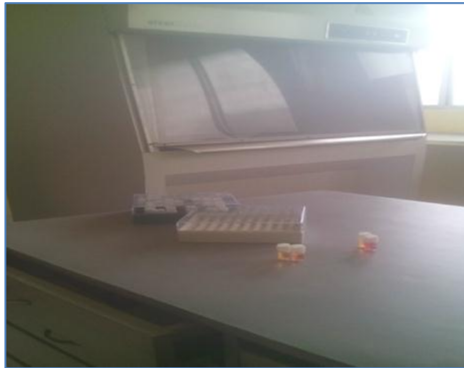
Fig. 2: Urogenital Mycoplasma Broth