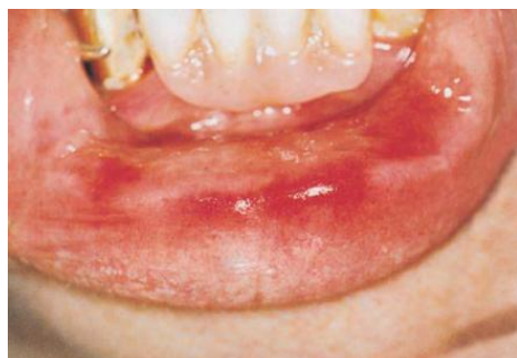
Fig.3. Burning Mouth Syndrome