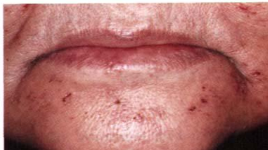
Fig. 1 Peri-oral erythema and ulcerations.