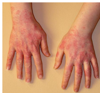
Fig.4 Allergy to latex gloves