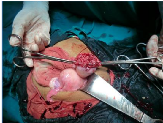
Fig. 1: INTRAOPERATIVE PICTURE - RUPTURE OF NON COMMUNICATING HORN