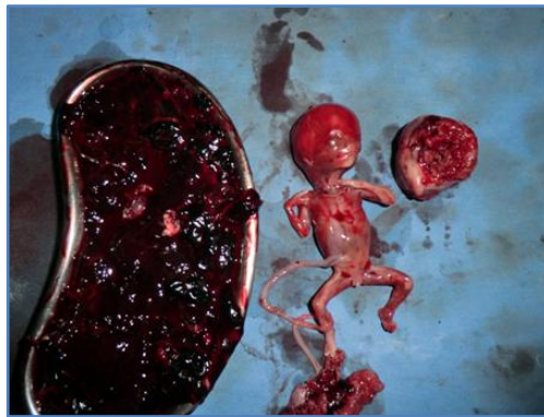
Fig. 3: HEMOPERITONIUM, FETUS, EXCISED RUPTURED HORN