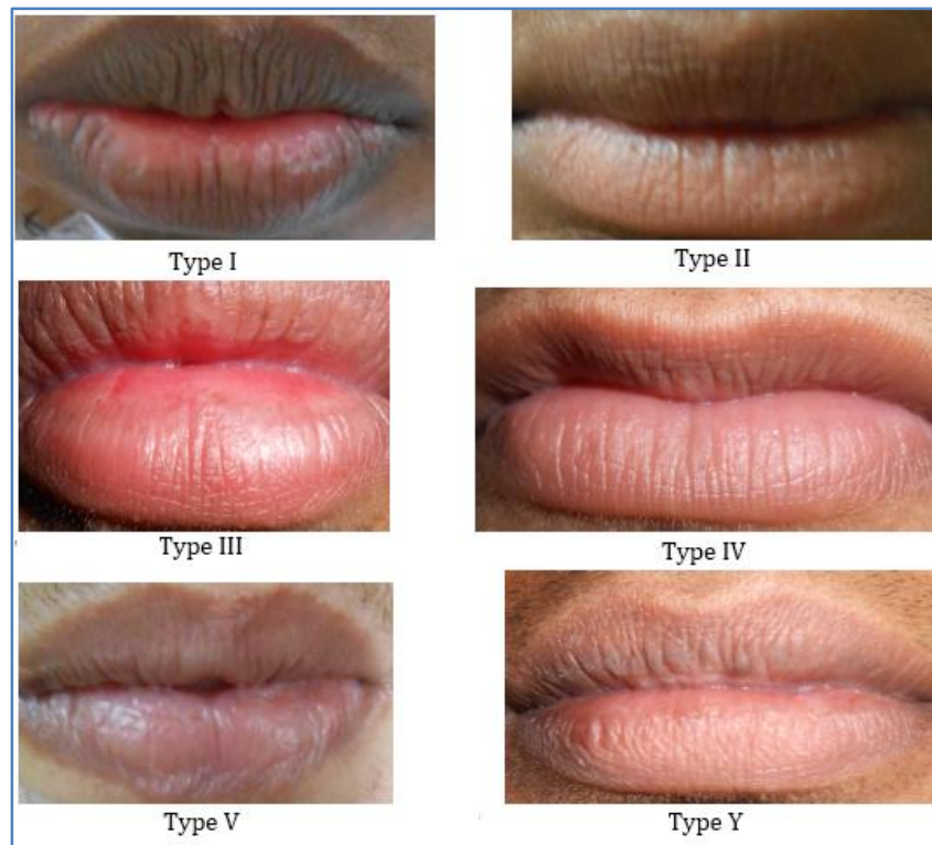
Figure B: Pictures of Male lip print pattern