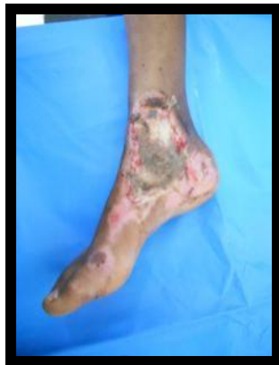
Post traumatic medial malleoli exposed