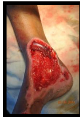
Peroneus brevis muscle flap covering the malleoli