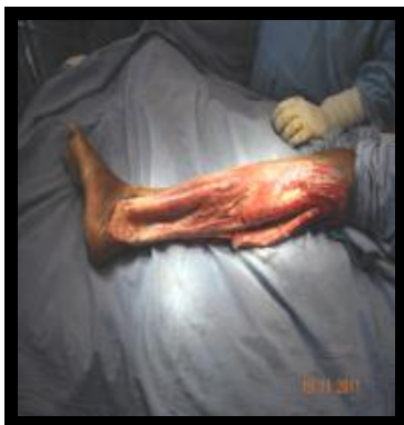
Post traumatic degloving injury of lateral side of leg with exposing the tendo achilles tendon