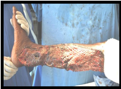
Raw area covered with meshed skin graft