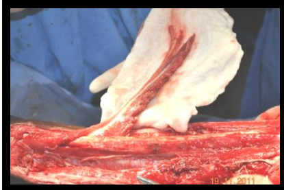
Peroneus brevis muscle flap to cover tendo achilles