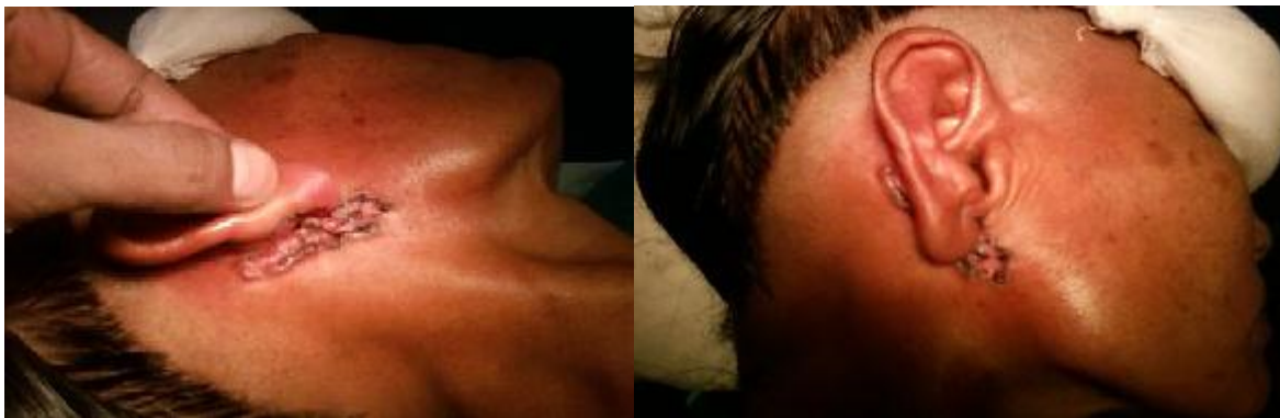
Pre-operative (BCC in right retroauricular region)

DISCUSSION: BCC is a type of skin cancer, 65-85% found in head & neck region. In head & neck region 12% of lesion are found on the auricle. It is found primarily on the posterior surface of auricle followed by the preauricular & then the retroauricular areas 1,2 . Sun exposure is the number one risk factor for the development of BCC. Genetic factor is also an important factor, in that loss of heterozygosity for chromosome 9q markers 3 . There are several pathological types of BCC that differ in their appearance histologically & grossly & in their behavior. They are nodular, ulcerative, pigmented, superficial, morphea form/sclerosing & basaloid squamous 4 .