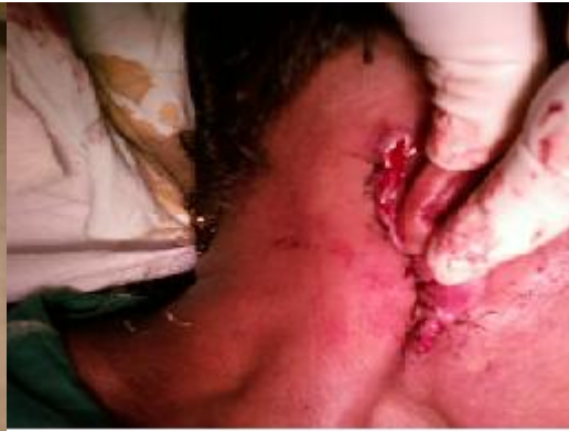
Primary closure of wound