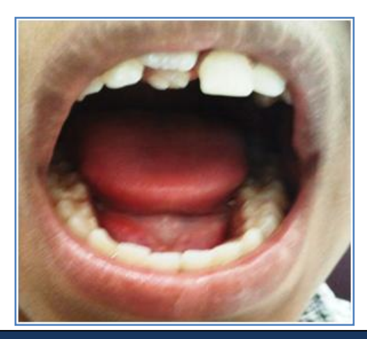
Fig. 2:A talon cusp on right maxillary supernumerary tooth and presence of one extra lateral incisor on the same side.