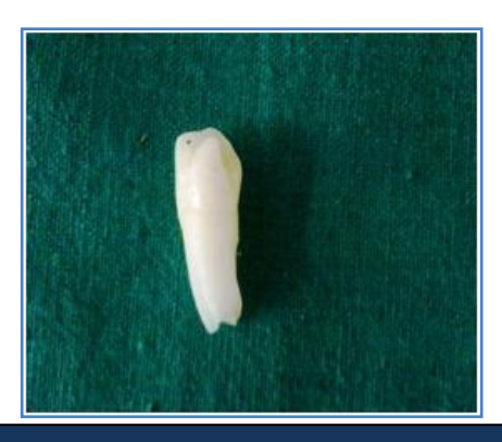
Fig. 4:Extracted supernumerary tooth. Talon cusp on the palatal surface of the supernumerary tooth, extending from the cementoenamel junction to the incisal edge.