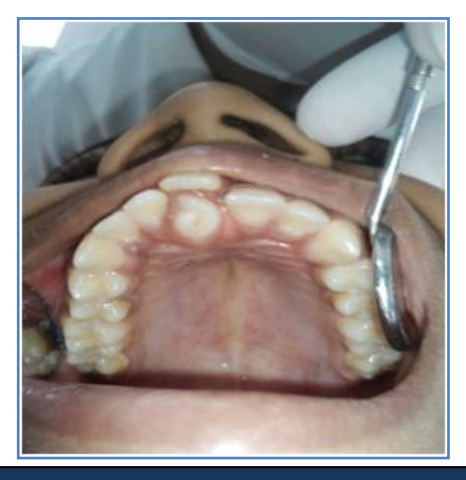
Fig. 1:A talon cusp on a right maxillary supernumerary tooth resulting in slight labial position of the right central incisor and midline diastema.